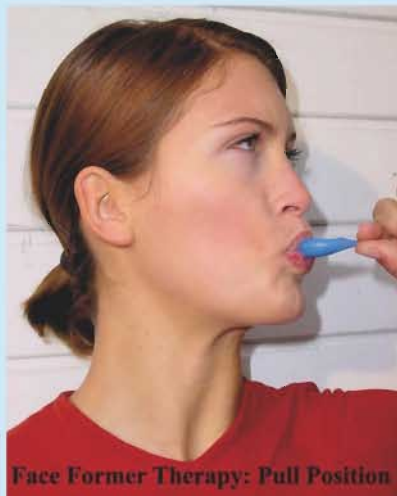
Face Former Therapy: Pull Position