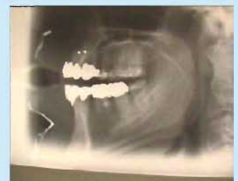
Changes of habitual bite situation and muscle tension by Face Former Treatment