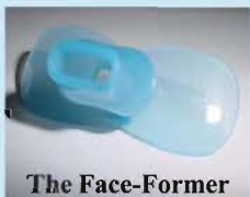
The Face-Former Equipment of the treatment