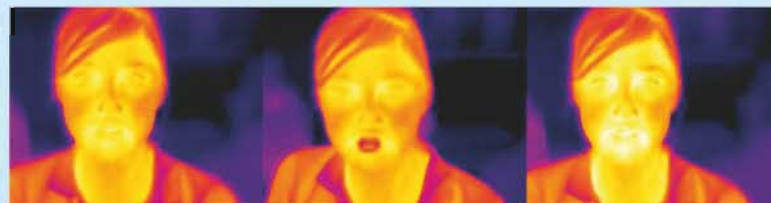
Thermography: : Shows the extent of muscle activation with Face Former Treatment